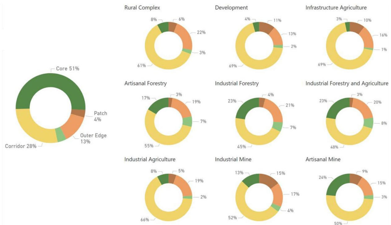
Figure 2. Distribution of forest fragmentation classes in the Congo Basin study area (left) and the proportion of fragmented forest classes affected by disturbance associated with each driver archetype. Proportions are estimated by the number of visually interpreted points.

Multiple factors drive deforestation and forest degradation in the Congo Basin. The combination of small-scale agriculture that drives and follows construction of roads and settlements is the largest contributor to deforestation and forest degradation in the Congo Basin. From 2015-20, subsistence agriculture by small-scale farmers in rural areas was the main driver of deforestation and degradation in the Congo Basin. However, subsistence agriculture mostly impacts secondary and fragmented forests. Core primary forests are only accessible with heavy and expensive machinery, such as that used for logging and mining. The presence of industrial activities is more prominent in core forests (see Figure 2) and opens previously inaccessible intact or remote forest areas to other forest-risk activities, such as the establishment of settlements, roads, and agriculture. In the same 2015-20 period, the rate of deforestation driven by industrial activities such as mining and agriculture remained steady and artisanal forestry showed an increasing trend. However, these commercial activities in intact core forests have a greater impact on carbon stocks and biodiversity in the long-term than agricultural conversion of fragmented and secondary forests. Indirect factors such as lack of tenure security, weak governance and institutions enable encroachment into forest areas and adds pressures on forests.