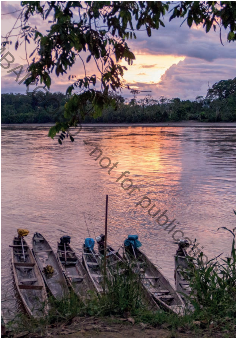
Left: Sunset over the Santiago (Kanus) River in Wampis territory in the Peruvian Amazon