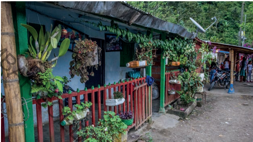
A Humanitarian Zone in Antioquia, Colombia, created for communities displaced during the armed conflict

Compounding this issue, on 9 September 2020, President Duque signed Directive No. 8, establishing new guidelines for managing the prior consultation process for new development projects. The directive makes the timelines for consultation even more rigid instead of providing the flexibility needed to respect customary collective decision-making and meet communities' needs during the COVID-19 crisis. For example, the directive limits development projects' "area of influence"—the areas affected by projects and on which those approving the projects are required to consult with indigenous peoples.