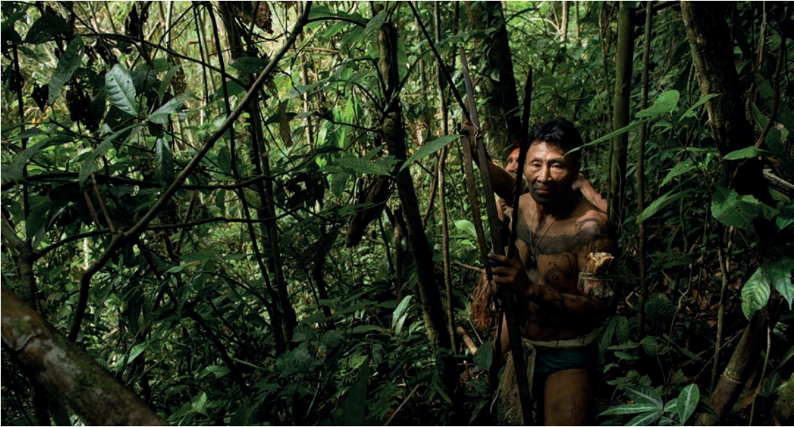
Below: Nahua hunters in the Peruvian Amazon