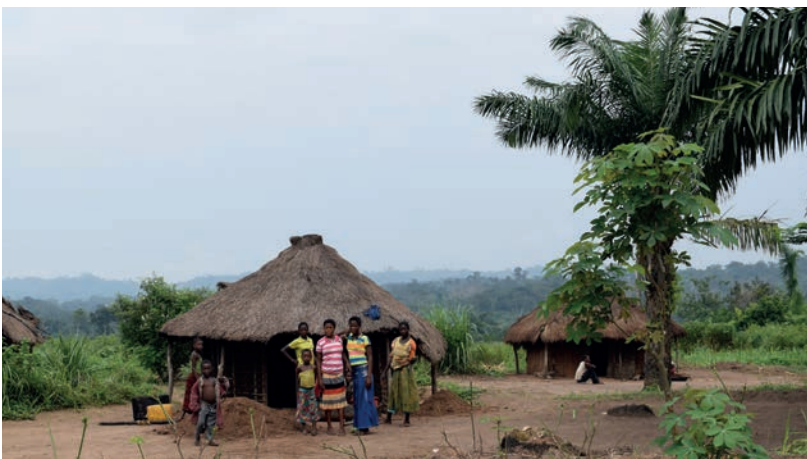
Tshiefu Village, DRC Indigenous women of Tshiefu village are denouncing poverty as one of the consequences of deforestation in their village

The fear of COVID-19 being transmitted from cities and towns to rural communities also became a barrier to consultation channels between the government and forest communities. Even though meaningful consultations are impossible in this context, the government pressed ahead with its deliberative processes for new policies that affect the rights of indigenous and forest peoples. One of these policies is the National Land-Use Planning Policy (PNAT), a pillar of the government's priority to advance economic growth and development. This policy is discussed further in Finding 3.