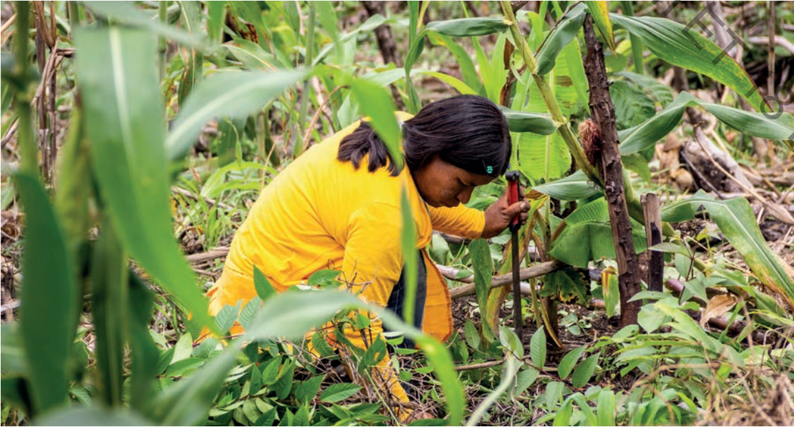
Below: A Kichwa woman tending her crops in Mishkiyakillu, Peru