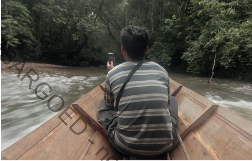
An indigenous man from Long Isun in Indonesia uses GPS to map his community's territory in East Kalimantan