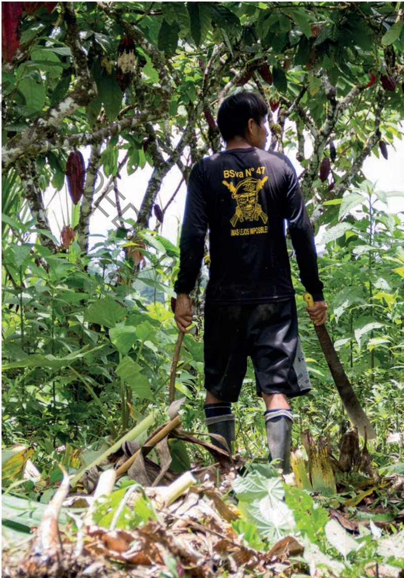
Left: A Wampis cacao farmer in the Peruvian Amazon