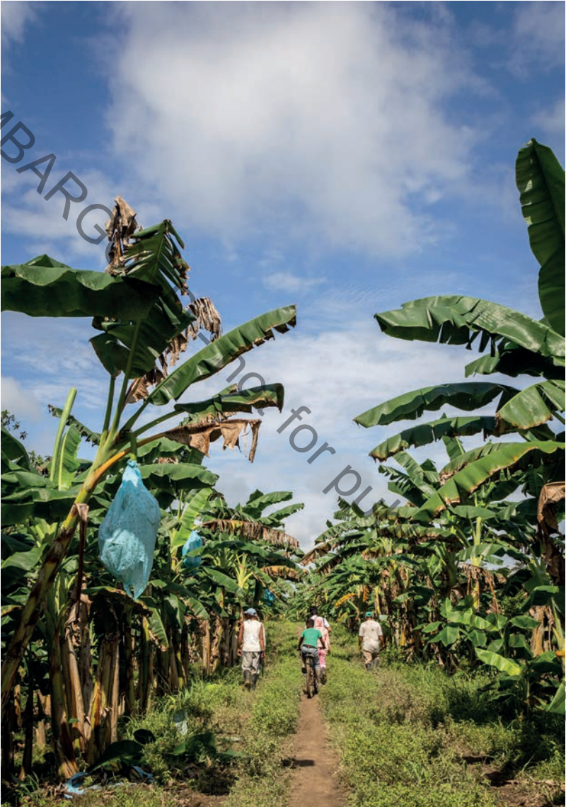
Left: Landgrabs have taken place across Colombia