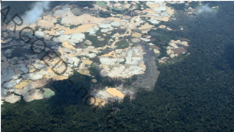
Amazon landscape scarred by open-pit gold mining in Brazil

Brazilian mining authority Agência Nacional de Mineração (ANM) has received more than 3,000 requests to mine on indigenous peoples' land in the Amazon, including 145 new requests filed in 2020, according to a study released in November 2020 by the Mined Amazon project. This constitutes the largest number of requests filed in 24 years.