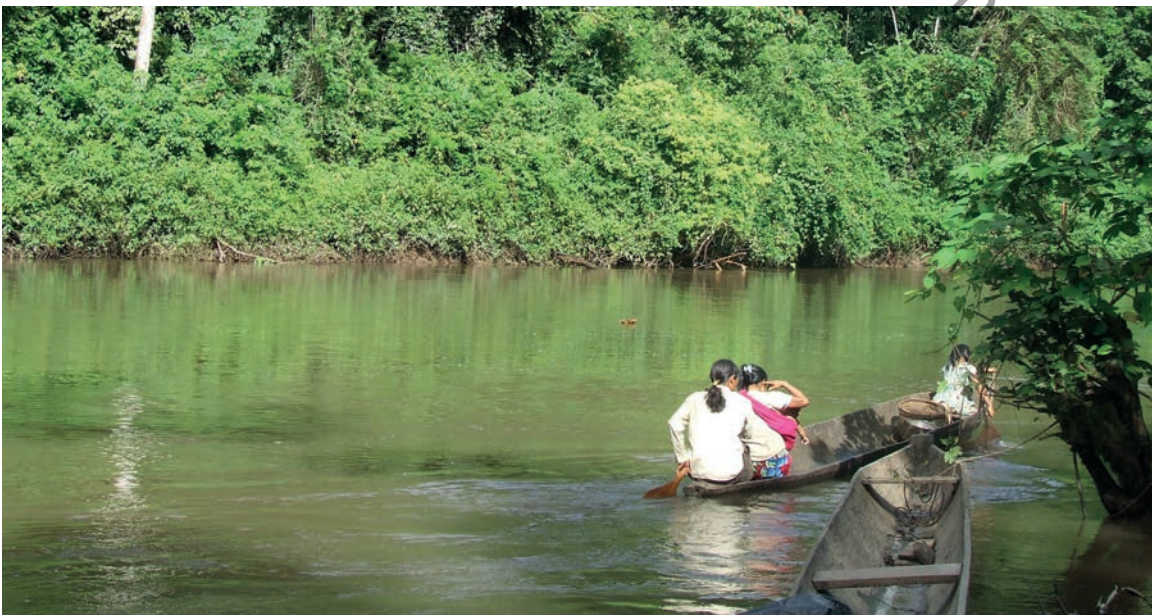
Below: Achuar community members in Peru