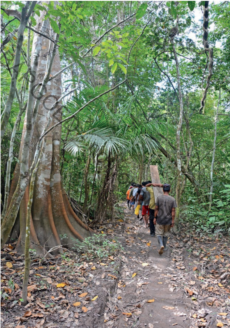
Left and below: Monitoring territory for illegal logging in Shipibo community of Panajillo, Ucayali. June 2018