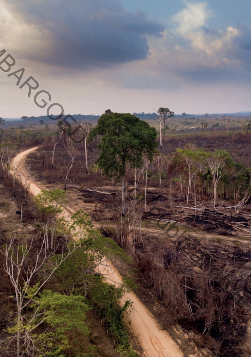
Left: Jamanxim National Forest, Para, Brazil