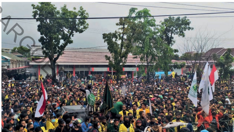
Omnibus Law protests 2020 in Padang, Indonesia