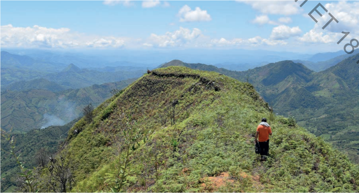
Below: A medicinal plant garden in an indigenous reserve in Colombia