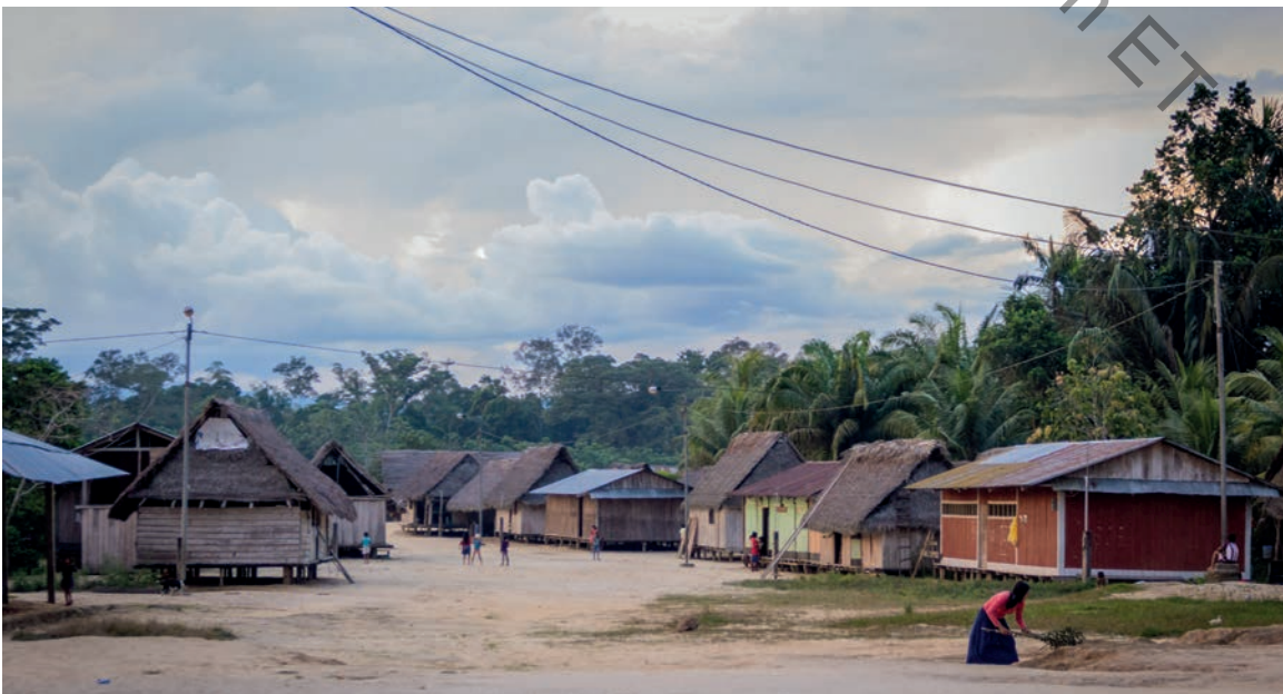
Below: The Wampis village of Soledad