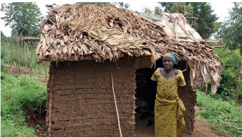
Village in the Democratic Republic of the Congo

Criminalisation of indigenous rights defenders: The government has continued to arrest and criminalise indigenous human rights defenders during the pandemic. In February 2020, following a rushed trial, 8 Batwa community members received prison sentences, some for 15 years, for re-settling in their own lands in Kahuzi-Biega National Park. Their subsequent appeals have been postponed multiple times. The Batwa had been evicted, losing their means of subsistence, in 1975, when the park was extended.