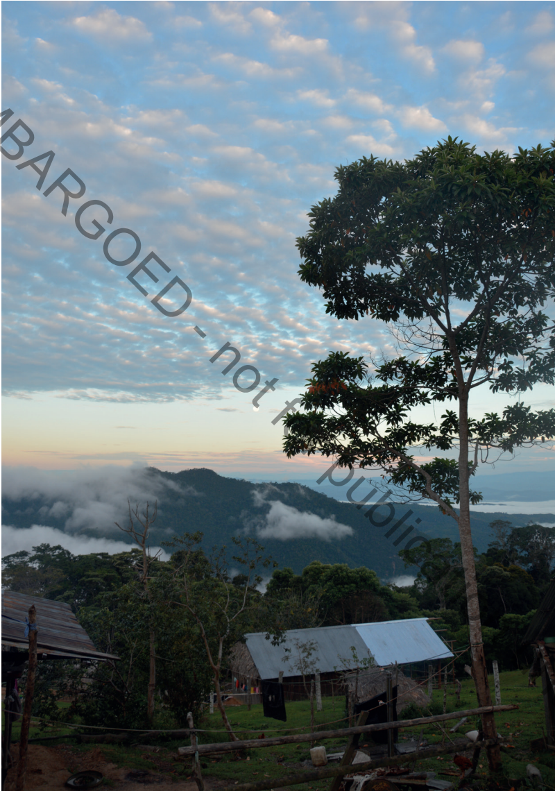
Left: Nuevo Lamas de Shapaja, San Martin, Peru