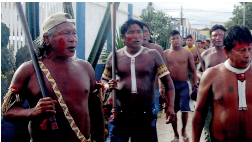
Mëbengôkre-Xikrin warriors arrive in Altamira for a meeting on the impacts of the Belo Monte hydroelectric power plant in 2012

– Extract from a letter from indigenous communities in the Xingu Basin, Brazil 155