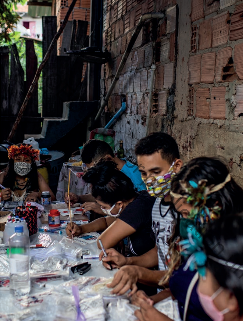
Left and below: The Association of the Satere-Mawe Indigenous Women are making protective facemasks in Manaus, Brazil, 2020