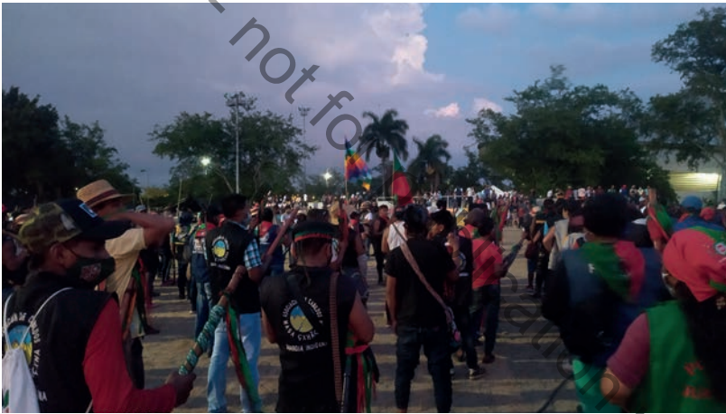
Indigenous guards during a collective mass protest, or minga , in Cali, Colombia. October 2020

For the Consejo Regional Indígena del Cauca (Regional Council of Indigenous People of Cauca), the indigenous guard “[i]s conceived as an ancestral organism of its own and as an instrument of resistance, unity and autonomy in defense of the territory and the life plan of the indigenous communities. It is not a police structure, but rather a humanitarian and civil resistance mechanism”.